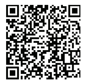
Read more about the camp on lions.no